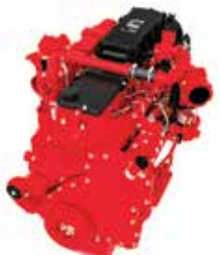
Cummins® L9 Engine